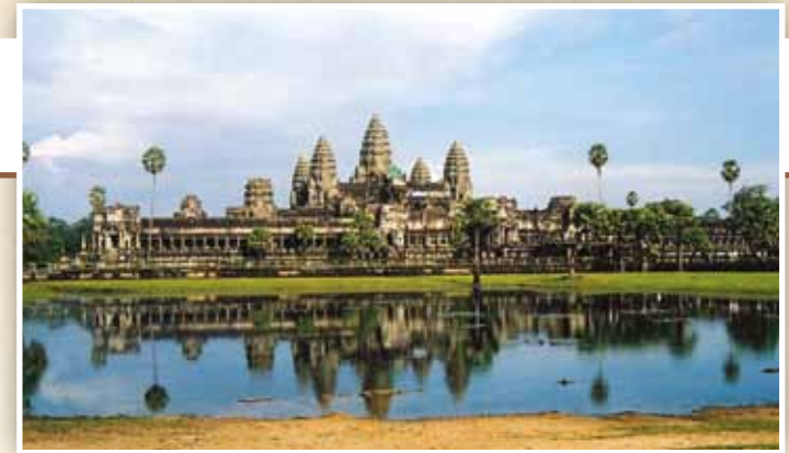
Angkor Wat, Cambodia

ASCO International LTD is a leader company for DMC (Destination Management Country) in the region of Indochina (Vietnam, Cambodia and Laos) and Thailand. The company was founded in 1995, registered in Hong Kong, and from September 2008 changed its name to ASCO LOTUS, after merging with Lotus Asia Tours, a travel company operating in Malaysia, Singapore and Indonesia.