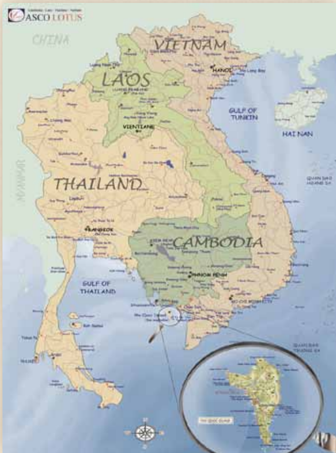
Thailand & Indochina